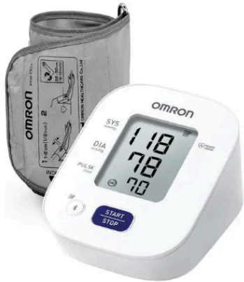
REGULER HEALTH CHECK UP DEVICES DIGITAL BP MONITOR

Angel Meditech: Delivering Care Through Quality Equipment