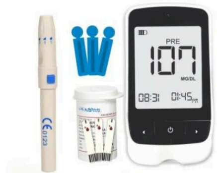
REGULER HEALTH CHECK UP DIVICES GLUCOMETER